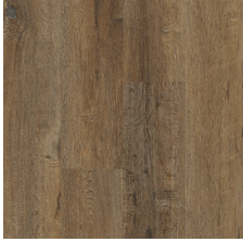
Fall Harvest RKEG60L02E