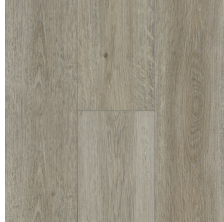
Beach Grass EKEP70L01E