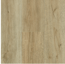
Nature Time EKEP70L02E