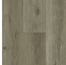
Curator Gray EKEP70L07E