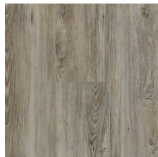
Ocean Style RKEG70L04E