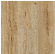
Sand Washed RKEG70L02E