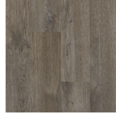
Mountain City RKEG60L05E