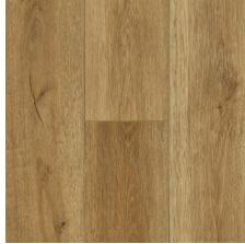
Wheatland Hills EKEP70L03E