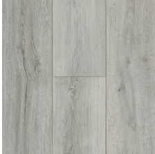
Dreams Fly EKEP70L09E