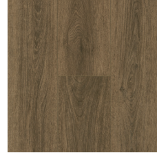
Friendly Trail EKEP70L04E