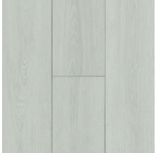
Breezy Cloud EKEP70L08E