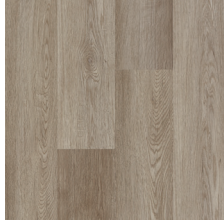
Deep Taupe RKEG60L03E