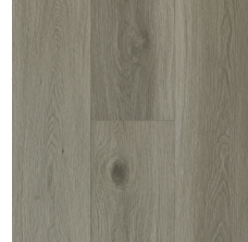
Atlantic View EKEP70L10E