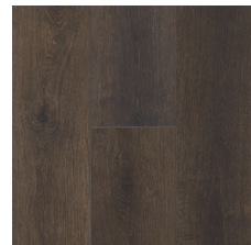
Dark Timber RKEG70L05E