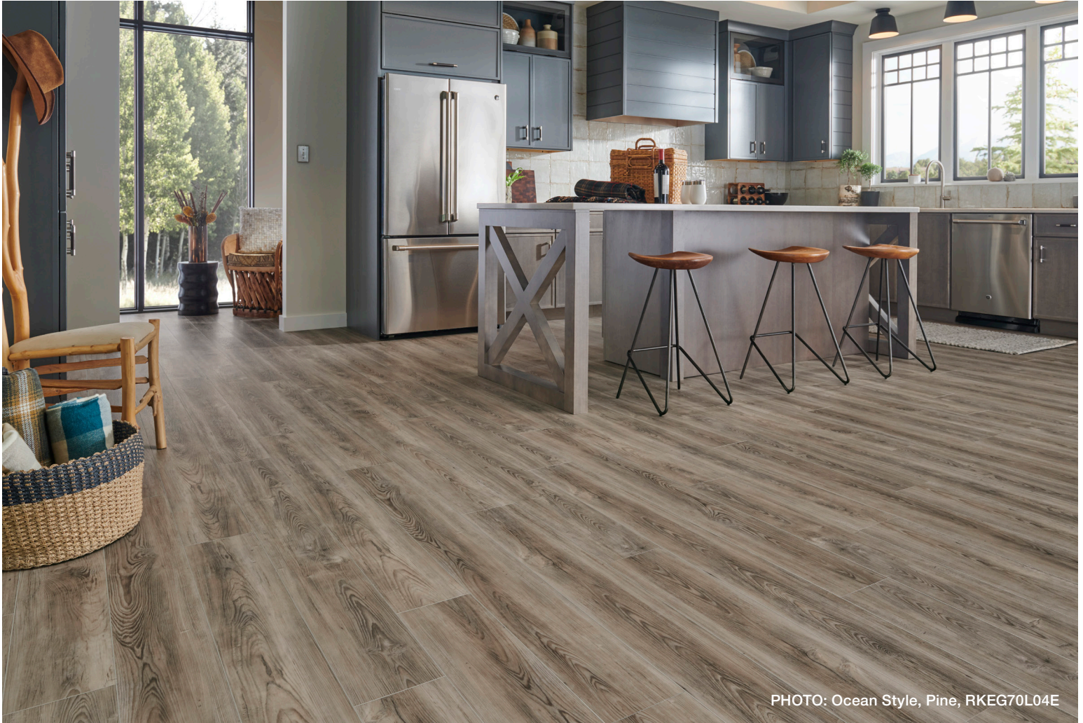
PHOTO: Ocean Style, Pine, RKEG70L04E