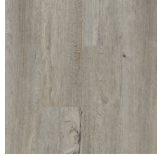
Crystal Gray RKEG60L04E