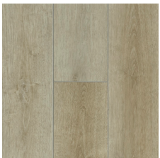
Botanical Tan RKEG70L01E