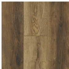
Southern Hills RKEG70L03E