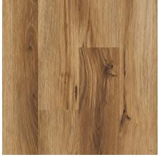
Timeless Look RKEG60L01E