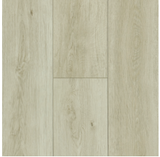
Calmeest Taupe EKEP70L05E