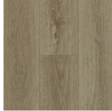
Sea Oat EKEP70L06E